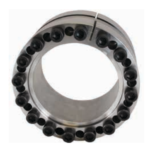
Eaton Floating Housing Brakes have an exclusive Taper Shaft Lock that improves reliability.

Reliability is essential in emergency situations. The FHB friction design and material are capable of absorbing 2,400 emergency stops before a friction replacement is needed.